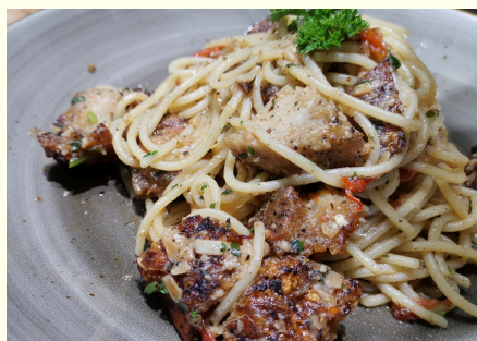
ITALIAN PORK BELLY AGLIO OLIO 14 Oven-roasted pork belly tossed in spaghetti aglio olio