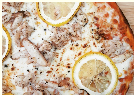
CRAB & LEMON 12" (21)

With real crab meat, tomato, oven-baked with thin-slices of lemon & mozzarella