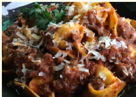
TORTELLINI BOLOGNESE 17 Tortellini pasta filled with 4 cheese, tossed in homemade minced beef Pomodoro & shaved Parmigiano