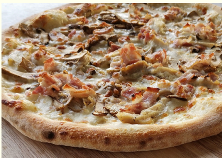
ALFREDO 12" (22) Bacon, chicken & mushroom in light Alfredo cream, topped with shaved parmesan