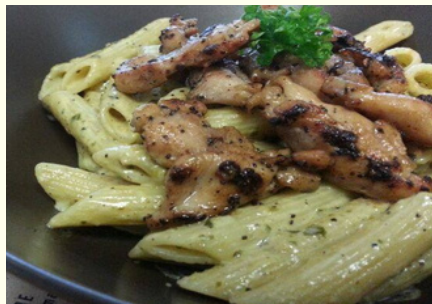
GRILLED CHICKEN PESTO CREAM 14 Served with penne