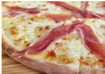
CRUDO ZOLA 12" (25)

Italian roasted pork belly, fresh cherry tomatoes and mozzarella