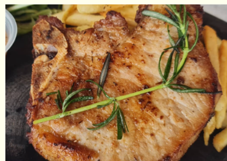
CAJUN ROSEMARY PORK CHOP Pan-Seared Cajun Rosemary Pork Chop served with fries & Homemade Mushroom Sauce | Make it a double chop (2pcs)