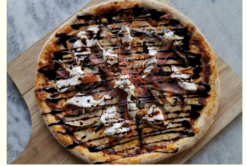
BURRATA E PROSCIUTTO DI PARMA 12" (25)

With bacon, bocconcini, handmade pork sausages, egg & fresh rocket