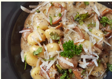
GNOCCHI SAUSAGE TRUFFLE 16 Potato pasta tossed with Italian pork sausage & truffle cream sauce, topped with Parmigiano