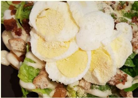
CLASSIC CAESAR 9 Romaine, cherry tomatoes, egg, croutons, bacon & homemade Caesar sauce