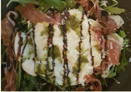
BURRATA & PARMA HAM 17 Italian burrata, fresh rocket, parma ham, balsamic & truffle drizzle