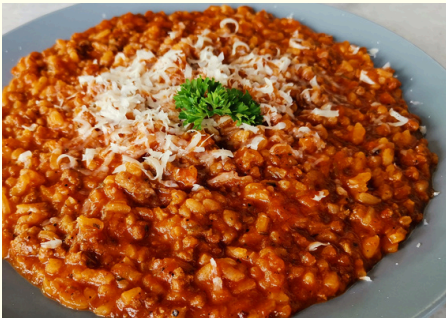
MINCED BEEF POMODORO 15

Deliciously grilled Seabass, served with light cream mushroom risotto