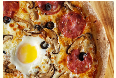
BARI 12" (21) With slices of spicy pork salami, olives, pomodoro, mozzarella, mushrooms & egg. Non-spicy option also available