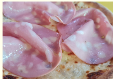
MORTADELLA GORGONZOLA 12" (25)

Spicy pork salami with a hint of peppercorn, pomodoro & mozzarella. Non-spicy option available.