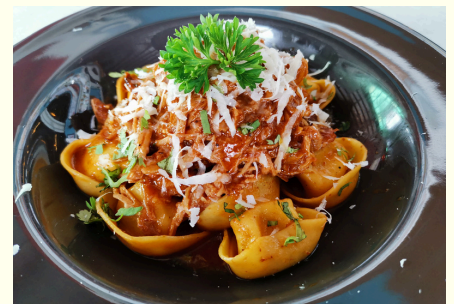
PULLED PORK TORTELLINI 18 4 cheese tortellini tossed with 8 hours slow-cooked pulled pork in its own sauce with cream & shaved Parmigiano