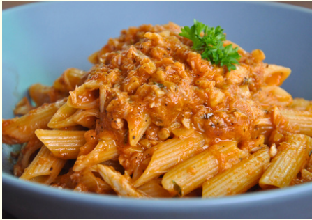
VODKA CRAB MEAT 16 Crab meat in pink sauce & vodka