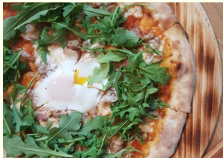
PANCETTA RUCOLA 12" (19)

With pomodoro, mozzarella, bocconcini, rocket, truffle & balsamic reduction