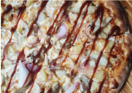
GRILLED CHICKEN & PINEAPPLE 12" (19) With fresh onions, mozzarella & bbq sauce