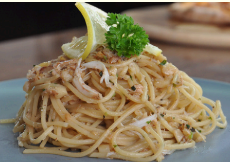
LEMON CRAB MEAT 14 AGLIO OLIO Fresh crab meat tossed with aglio olio and fresh lemon juice