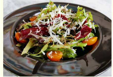
INSALATA MISTA 7 Mesclun mix with fresh cherry tomatoes, homemade balsamic vinaigrette & shaved Parmigiano