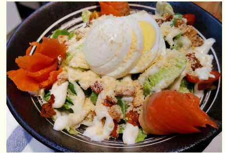
SMOKED SALMON CAESAR 13 Classic Caesar with smoked salmon