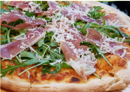
PARMA HAM & ROCKET 12" (25) King of Italian ham topped with arugula, shaved Parmigiano Reggiano & drizzled with truffle oil