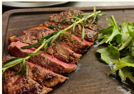
CONTRAFIETTO Sirloin (200g)