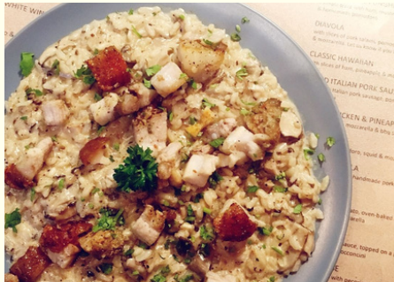
ITALIAN ROASTED PORK BELLY 16

Tossed with risotto, garnished with parmesan