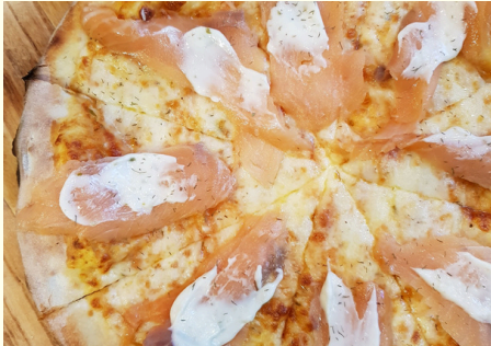
SMOKED SALMON 12" (20)

Topped on our pizza with mozzarella, pomodoro, dill & homemade sauce.