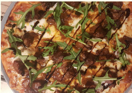
BRAISED ANGUS BEEF CHEEKS 12" (25)

With pomodoro, mozzarella, bocconcini, rocket, truffle & balsamic reduction