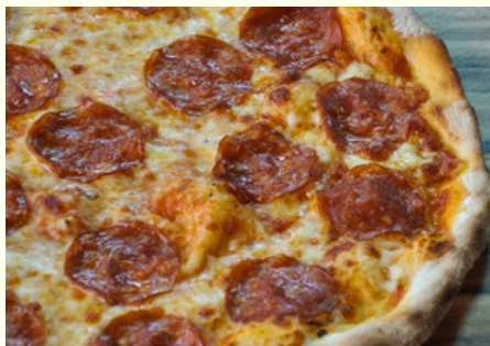
CASALINGO PEPPERONI 12" (19)

Spicy pork salami with a hint of peppercorn, pomodoro & mozzarella. Non-spicy option available.