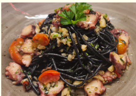
NERO E NERO 19 Portuguese Octopus & Cherry Tomatoes, White Wine Aglio Olio with Spaghetti made with Squid Ink