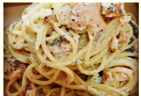
SALMON RAGU 15 Salmon in dill cream sauce