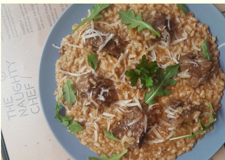
BRAISED ANGUS BEEF CHEEKS 21

Wild mixed mushrooms, truffle cream risotto, shaved parmigiano