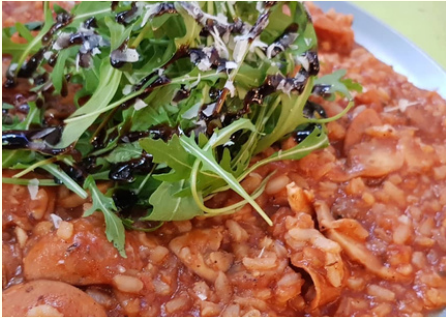
CHICKEN & ITALIAN PORK SAUSAGE 16

Tossed with risotto, homemade pomodoro, topped with rocket & balsamic reduction