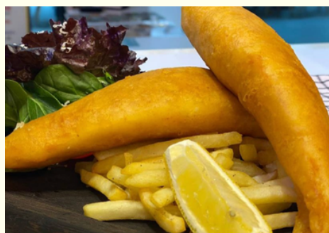
BEER BATTERED FISH AND CHIPS Homemade Beer Battered Seabass & Chips served with homemade Tartare