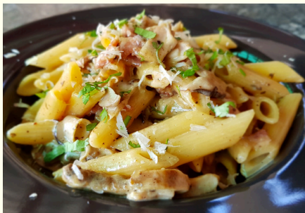
BCM ALFREDO 16 Bacon, chicken & mushroom in light Alfredo cream, topped with shaved parmesan