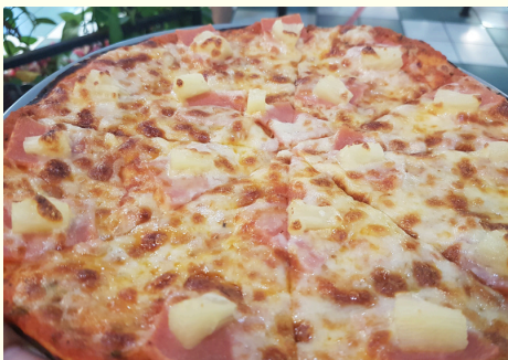
CLASSIC HAWAIIAN 12" (17)

Portobello & Parma Ham topped with Burrata and Balsamic reduction