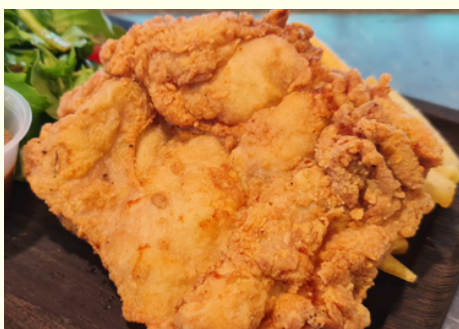
BATTERED CHICKEN CUTLET Deep-fried Chicken Cutlet, marinated in-house, served with fries, salad & homemade mushroom sauce. Option to Change to Grilled Chicken Chop