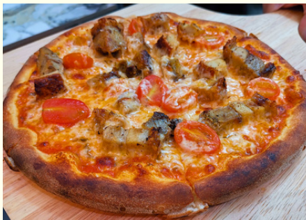
PORCHETTA 12" (20)

Portobello, shiitake, truffle cream & mozzarella