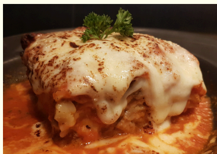
BEEF LASAGNA 14 Oven-baked with homemade Bechamel sauce