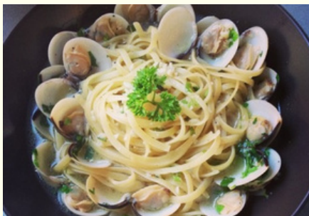
WHITE WINE VONGOLE 15 Asiatic white clams tossed with garlic in a delicious white wine sauce