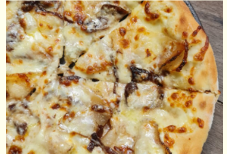
GUANCIALE 12" (25) White pizza topped with cream, mozzarella, gorgonzola, guanciale & caramelised onions