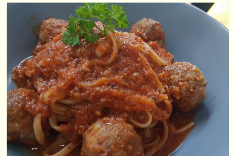
HANDMADE ITALIAN MEATBALLS 15