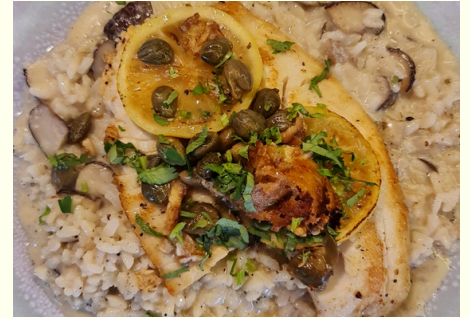
CAPER LEMON SNAPPER 17

Squid ink risotto tossed with mussels & Portuguese octopus