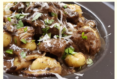
ANGUS BEEF CHEEKS 19 GNOCCHI With potato pasta & truffle mushrooms