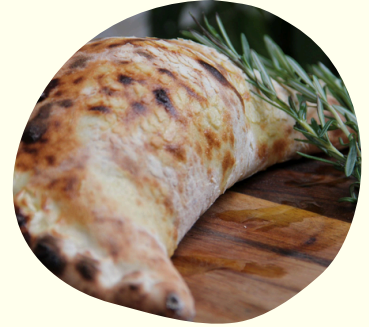
CALZONE (FOLDED PIZZA) +3