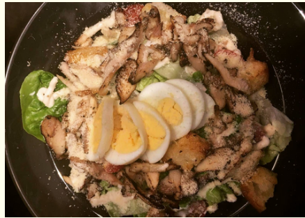
GRILLED CHICKEN CAESAR 12 Classic Caesar with chicken