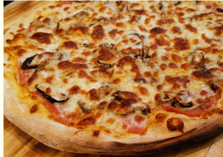
PROSCIUTTO E FUNGHI 12" (17)

Topped on our pizza with mozzarella, pomodoro, dill & homemade sauce.