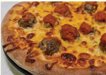
ITALIAN MEATBALL 12" (19) Handmade meatballs with pork, beef and Italian herbs, homemade pomodoro & mozzarella