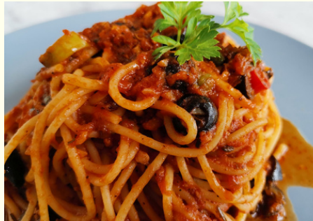
PUTTANESCA 14 With Pomodoro, black Kalamanta olives, green olives, chilli, capers & Sicilian anchovies