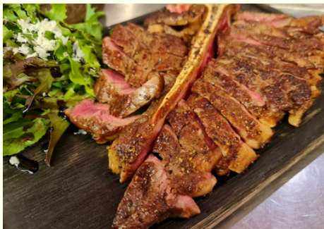
MINI FLORENTINE Porterhouse (500g)