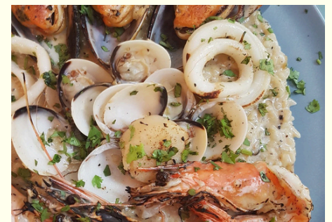
MARINARA RISOTTO 23

5 large grilled prawns topped on a deliciously cooked curry risotto, garnished with shavings of Parmigiano Reggiano