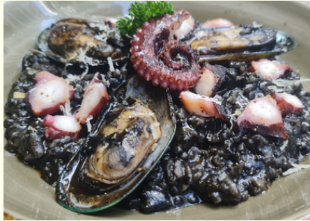
POLPO NERO DI SEPPIA 21

Tossed with risotto, homemade pomodoro, topped with rocket & balsamic reduction