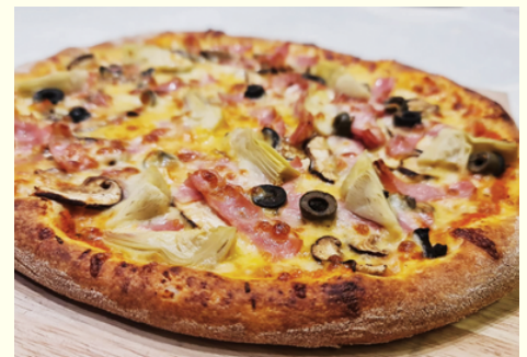
CAPRICCIOSA 12" (22)

With real crab meat, tomato, oven-baked with thin-slices of lemon & mozzarella