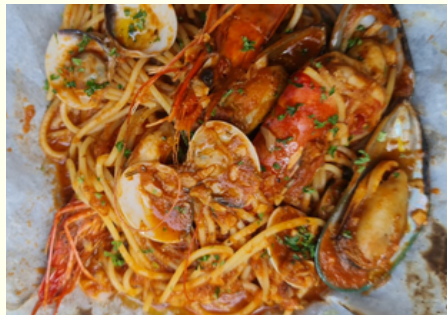
MARINARA CARTOCCIO 22 Large prawns, baby octopus, clams, and mussels in home made Pomodoro, wrapped with parchment