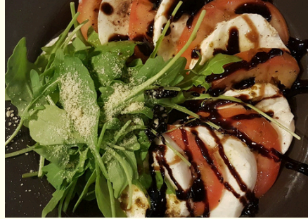
CAPRESE 15 Buffalo mozzarella, sliced tomatoes, balsamic reduction & pesto