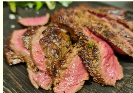
FILETTO DI MANZO Beef Tenderloin (200g)