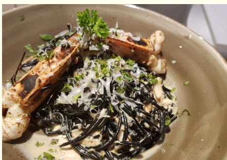
GAMBERI E GRANCHIO 21 Grilled prawns & crab meat in garlic cream sauce, tossed with spaghetti made with Squid Ink