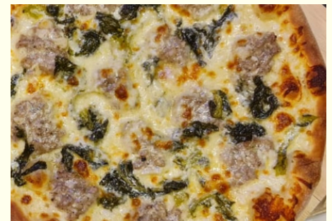
SAUSAGE & RAPINI PIZZA 12" (22)

Cream base with Gorgonzola, oven-baked & topped with Pistachio Mortadella