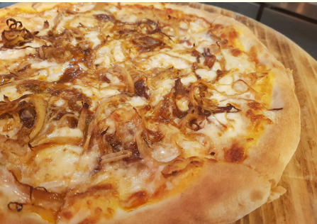
PULLED PORK 12" (21) Slow-cooked, juicy pulled pork topped with caramelized onions & bocconcini