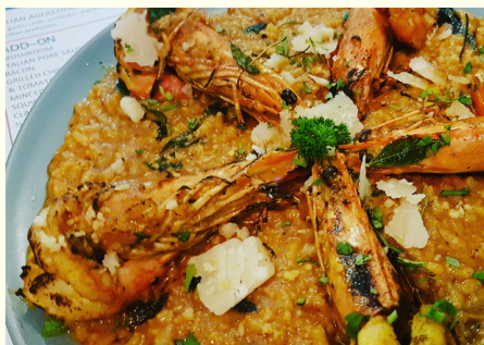
LARGE GRILLED CURRY PRAWN 25

Made with tender angus beef cheeks, truffle, mushrooms, shaved Parmigiano & arugula