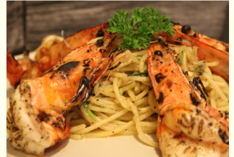
LARGE GRILLED PRAWN 19 AGLIO OLIO 4 large grilled prawns, served on a bed of sicilian aglio olio