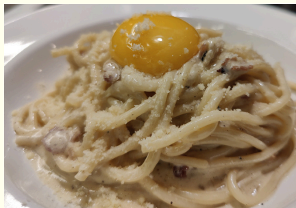
SMOKEY BACON CARBONARA 14 With bacon, cream and fresh egg yolk