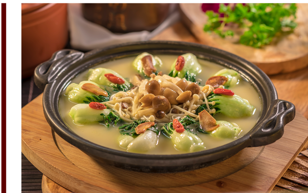
Fish Soup Nai Bai & Mushroom w Milk 三菇奶白鱼汤 $ 16.05 $ 29.96