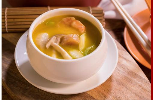
Pumpkin Soup /Pax 金汤 盅仔 $ 16.05 per Person