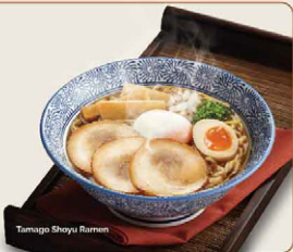
Tamago Shoyu Ramen