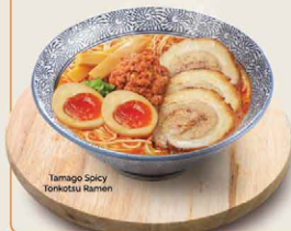
Tamago Spicy Tonkotsu Ramen