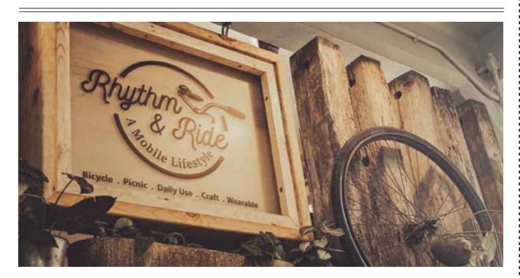
Check out the new "bike" on the block!

Over here, it's always picnic season. Our collaboration with Urban Journey Company allows us to provide fuss-free picnic experiences with all the essentials ready to go! Every basket comes with a complimentary set of table and chairs, mat, 2 drinks, 2 cakes, hand sanitizer, insect repellent spray and an additional 10% off our menu. Now, get your basket and go on a little adventure!