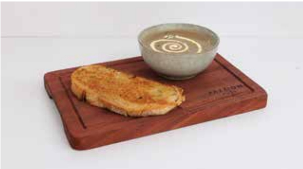
Wild Mushroom Soup